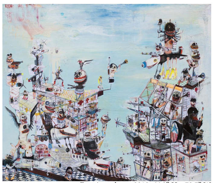
Fort Apocalypso, 2019, 66.9" H x 78.7" W

"Unraveled" is comprised of raw, somewhat unrefined appearances of heroes and anti-heroes; matched by the roughness of the painterly gesture with which they have been captured by the German artist on the canvas or the paper. There is no trace here of a meticulous painting style - instead the large-scale, vibrantly colored canvases have a crude, garish finish. Presented in five large-scale paintings and sixteen drawings, the visual motifs in Kinki Texas' universe are characterized by their reference to landmark history, psychology, culture and art history. These motifs are accompanied by written words, some of which have been sprayed on, others scratched or written with pen into the top layers of paint. The singing cowboys, warrior crusaders and bandaged skeletal figures may appear to have been quickly dashed off, but have in fact been developed over a period of months. Their lengthy process of creation is only revealed on closer inspection, when the different stages of the picture's evolution and its details can gradually be traced.